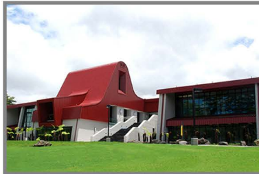
* Hale 'Ōlelo and 'Imiloa are located up the road from the main campus on Nowelo St.

'Imiloa is the Astronomy Center. A part of the University of Hawai'i at Hilo, it's used to inspire exploration through Hawaiian culture and science. 'Imiloa's Museum, Exhibit Hall, and awe-inspiring Planetarium shows are all open to the public.