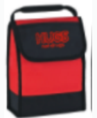
Fold-away lunch bag

Contact Heather Burt @ uhhcsout@hawaii.edu to pick up your choice of items.