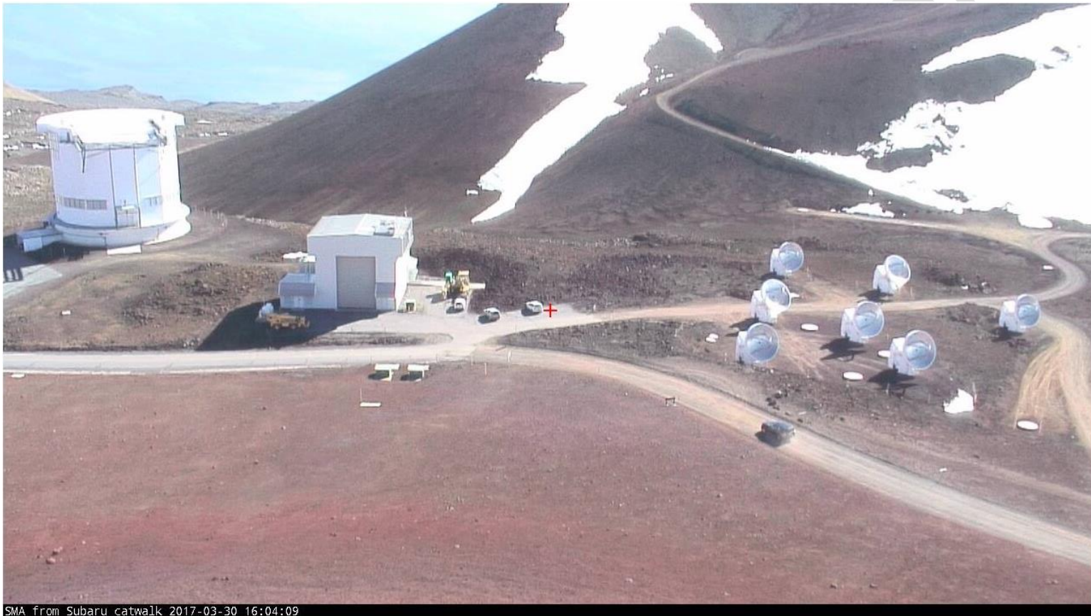
Figure 1. The SMA hangar (center), JCMT (left), and SMA antennas (right) viewed from the Subaru catwalk. The two existing HATs are located on the SW edge of the platform on the roof of the SMA hangar.