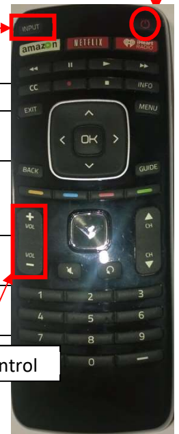
Figure 4 TV remote controller