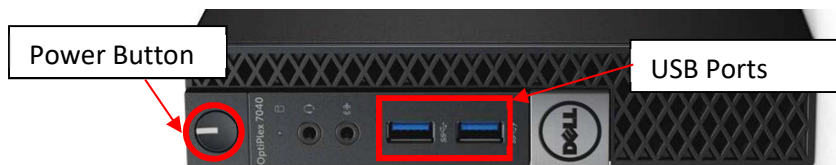
Figure 3 PC on/off switch and USB ports