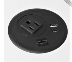
Figure 1 Power/HDMI grommet

Also, patrons can either bring their own laptop (given it has an HDMI port) or sign out an enhanced study room kit to use the MFF computer in the room.