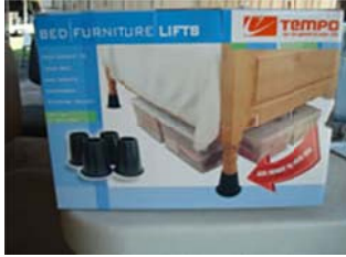
The raised section of the base is created by bed lifts.