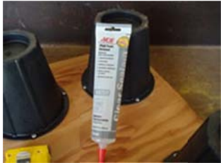
A bead of sealant should be applied at the base of lifts before screwing in to keep rain water from filling the lifts.