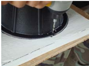
When screwing in the lifts, it is best to drill a hole through the lift. (The board needs a smaller drill bit, it is best to just screw into board without pilot hole.)