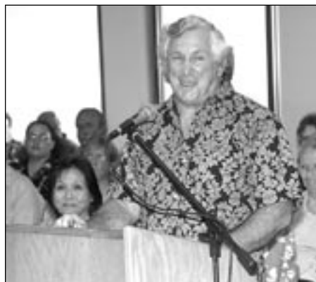
Johnson addresses questions regarding the proposed College of Pharmacy.

In other Board action, the establishment of an integrated